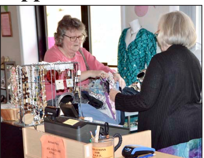
A S.A.F.E. Thrift Store customer in Blairsville attending the recent 20/20 sale.